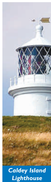
Caldey Island Lighthouse