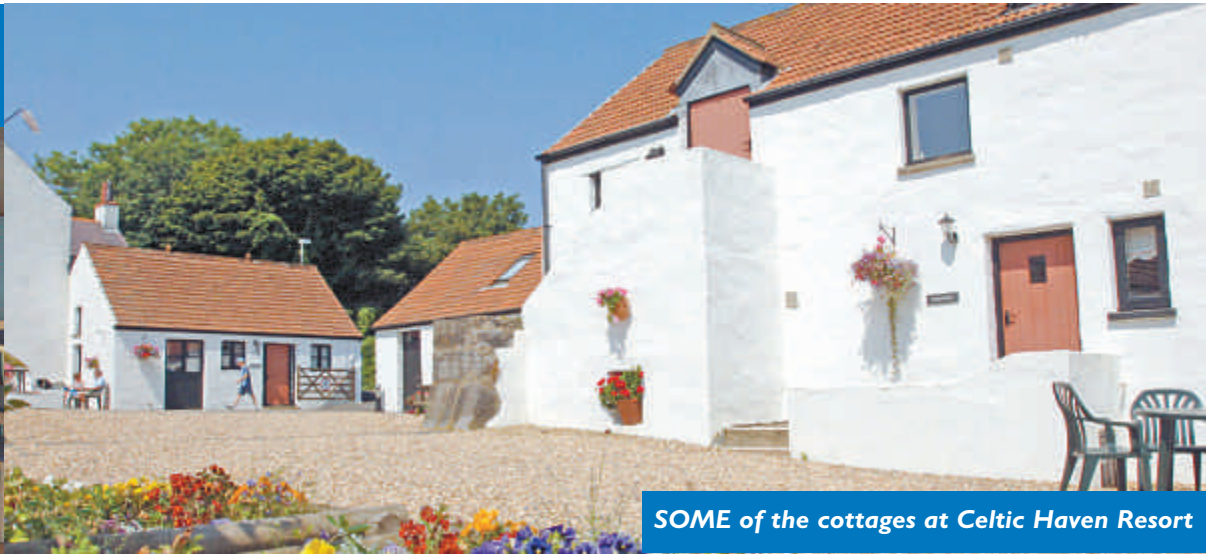
SOME of the cottages at Celtic Haven Resort

Asparagus, strawberries, all kinds of seasonal vegetables, beef, lamb, pork and, of course, a wealth of seafood delights, give Waves outstanding range and quality.